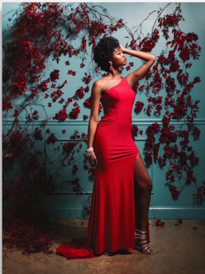
BayouLife, Fashion Spread