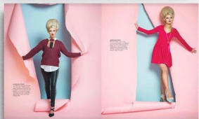
BayouLife, Fashion Spread