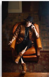
BayouLife, Fashion Spread