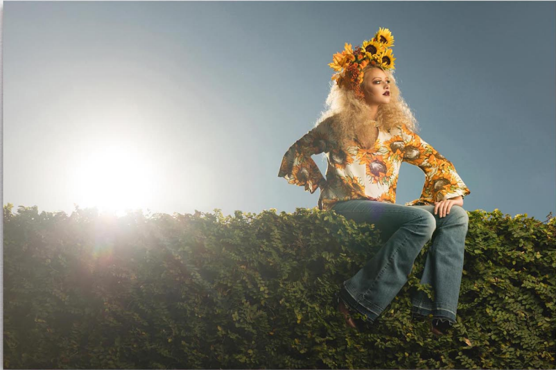
BayouLife, Fashion Spread