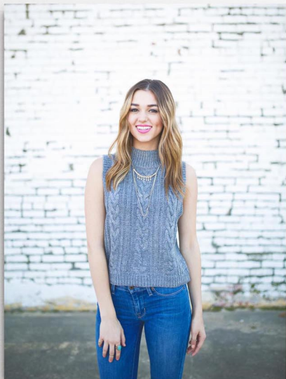
Sadie Robertson, Live Original Tour