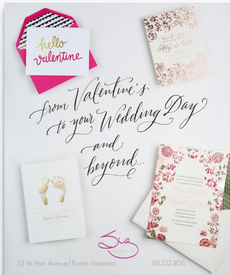
Sue Paperie, Magazine Advertisement