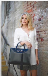
The Fashion of Ruston