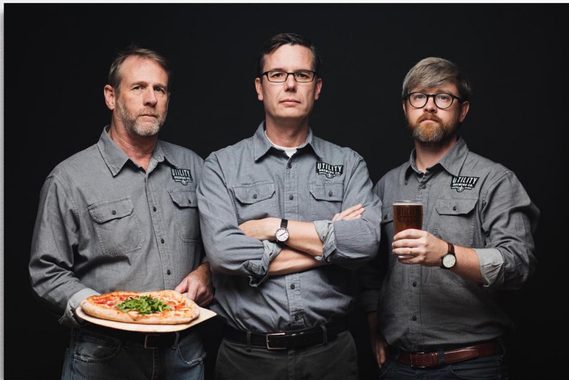
Owners, Utility Brewing Co.