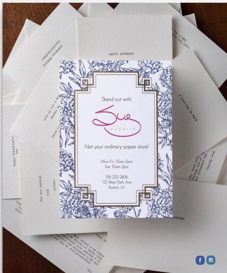
Sue Paperie, Magazine Advertisement