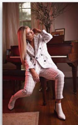
BayouLife, Fashion Spread