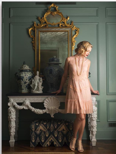
BayouLife, Fashion Spread

The fashion industry has an allure that draws me in; fashion photography provides the muse that keeps me striving for perfection. In this aspect of my work, I am duty-bound to show the clothing and the model in the very best light. I have made it a major part of my continuing education to advance my knowledge of all lighting techniques, so that I can produce photographs that fit the theme of the shoot or allow for the best possible portrayal of the clothing.